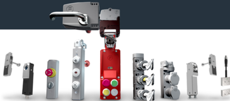
Interlock switches and control devices for automation safety