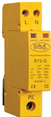
Part No. SY2-D Pluggable Module